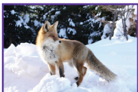
Photo Safari Assignment Series - Please see our website for more info!

"Animals" - Monday, April 4, 7:00 PM Email three of your selected jpgs to artfornow@northshorepubliclibrary.org by 4/3.